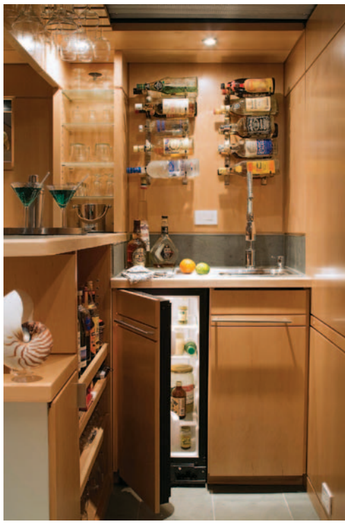
Home-time happy hour. Tucked into a corner, this wet bar has plenty of storage for glasses and bottles within easy reach of the bartender. The undersink cabinet and refrigerator doors are faced with maple-veneer panels to continue the sleek, clean look of the space. The bar top is angled to guide the eye out of the corner and toward the main sitting area. Set into the wall opposite the stairway, a display niche is another design trick used to draw the eye into the room. With its mirrored back, the niche gives the illusion of being another window, helping to lessen the feeling of being below ground level.