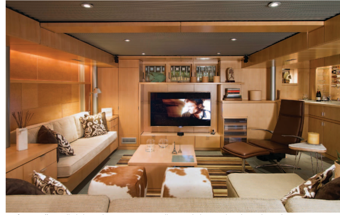
Sit for a spell. Installed above the entertainment wall, stained-glass windows by Andersen bring daylight into the space while screening the at-grade outdoor view. This lessens the impression of being in a below-grade room. The entertainment zone houses a 60-in. flat-screen television in its own niche, audiovisual components located behind a Plexiglas door, and storage for DVDs and CDs. The home's computer server and additional storage are located behind a large L-shaped door. Conroy's custom coffee table and built-in bench enhance the modern but cozy feel of this portion of the room.